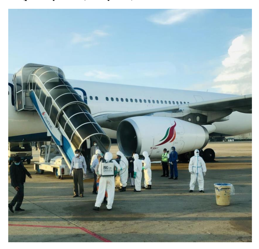
Figure 4: Passengers during their transit at Bandaranaike International Airport, Colombo (photo by author, 9 May 2020)