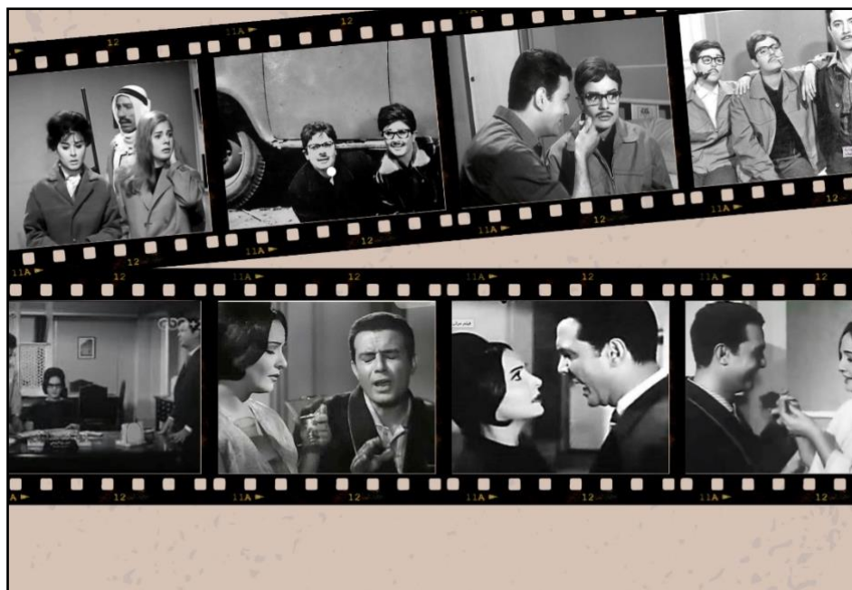
Figure 2: Snapshots of women in Egyptian dramas during the 1950s and 1960s

After Egypt's defeat in the 1967 war ( Nekssa setback ), Nasser's modernisation project was thwarted, leading Islamism to dominate the Middle East gradually. By contrast to the Arab nationalism project, Anwar Sadat (r. 1970–1981) approached a different political path of infitah (open door policy) in which he liberalised the political arena and eased restrictions on political Islamist groups as well as the Islamic establishment, Al-Azhar. Through Sadat's open policy infitah , Islamists and Islamic institutions gained political control over local culture. Sadat aimed to maintain a balance by empowering religious-oriented actors to counterweight Nasserist socialist opposition, which included influential young movements.