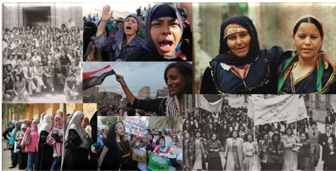
Figure 3: A compilation of images from the Guardian , The Atlantic , The Cairo Review & Global Affairs and Egypt Today shows the development of Egyptian women through history

Saudi Arabia poured petroleum dollars into regional and overseas countries to exert its influence. It offered opportunities for Egyptians and Arabs who moved into the Kingdom to be influenced by the country's culture and traditions. After returning home, Egyptian expats brought all of these with them, affecting a large portion of society. Like Saudi Arabia's Committee for the Promotion of Virtue and the Prevention of Vice, al-Jamaat al-Islamiyyia (Islamist Groups IG) in Egypt practised hesba (similar to morality police) by punishing those whom they considered as violating the fundamentals of Islam. These groups conducted armed attacks against unveiled women, Coptic Christians and liberal Muslim thinkers who opposed Islamising society, leading Egypt to the second wave of terrorism during the 1990s.